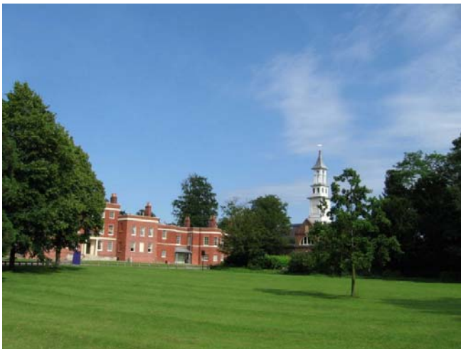
The Wellcome Trust Conference Centre in Hinxton

Following the success of the first Institute of Structural Molecular Biology retreat, held in Hinxton in June 2005, a second retreat was held almost exactly two years later. It took place at the Wellcome Trust Conference Centre in Hinxton, Cambridgeshire - which shares a campus with the Sanger Centre, where a third of the Human Genome was sequenced, and the European Bioinformatics Institute - on June 19 and 20, 2007. The packed, two-day-long programme included keynote lectures from three distinguished scientists, posters and oral presentations from students and postdoctoral researchers at Birkbeck College and University College, London, and an interesting session on careers in science.