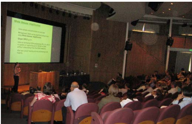
Student and Postdoc talks in the Francis Crick Auditorium

Five members of the FMO family are known to metabolise drugs: FMO1,2,3,4 and 5. FMO2 is found in the lung in several mammalian species, but in humans, specifically in Asians and Caucasians, there is a mutation in the FMO2 gene which causes premature truncation. However, 25% of the population of sub-Saharan Africa have a wild type FMO2 gene and produce a catalytically active protein. Asvi's project provides evidence that thiacetazone, a cheap and commonly prescribed anti-tuberculosis drug in Africa, is a substrate for FMO2. Thiacetazone can have severe side effects and produce liver toxicity. Individuals who express FMO2 are at greater risk, and this finding has implications for the prescribing of anti-tuberculosis drugs to susceptible individuals in Africa.