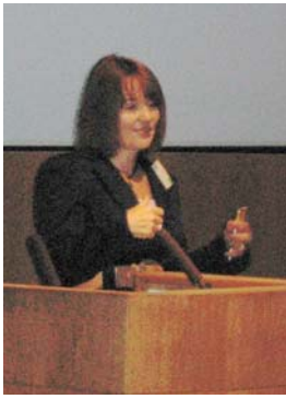
Professor Carol Robinson, from the School of Chemistry at the University of Cambridge